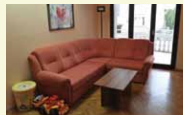
Roditeljska kuća Senjak